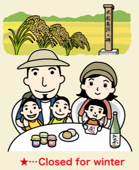
★Closed for winter

Embetsu produces high-quality glutinous rice and many other gourmet items such as melon, spinach, asparagus, rice wine, scallops and octopus.